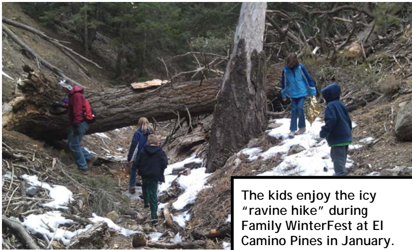
The kids enjoy the icy “ravine hike” during Family WinterFest at El Camino Pines in January.

February 26 : Service Project Day for Confirmation and Sr. High 12:15pm