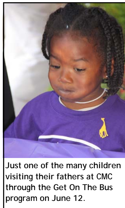
Just one of the many children visiting their fathers at CMC through the Get On The Bus program on June 12.